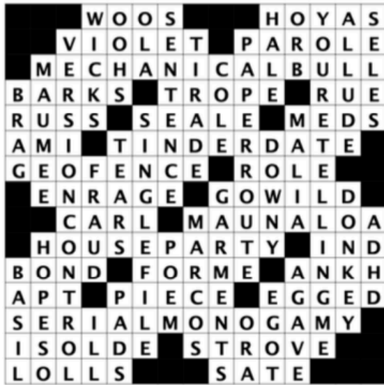
Puzzle #5 – Nam Jin Yoon