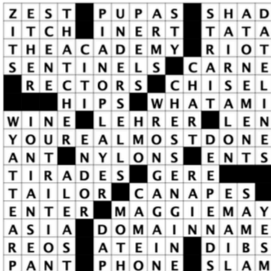
Puzzle #7 – Evan Birnholz