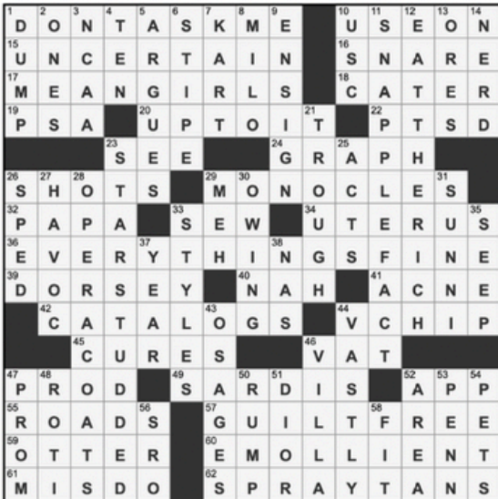
Puzzle #7 – Portia Lundie