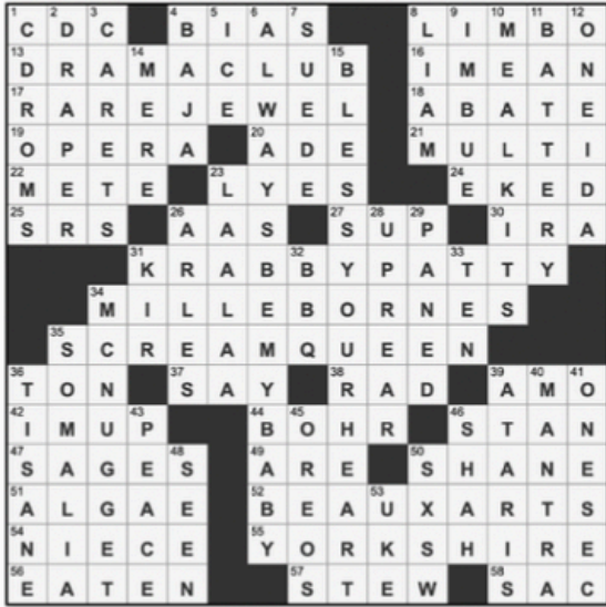
Puzzle #5 – Kelsey Dixon