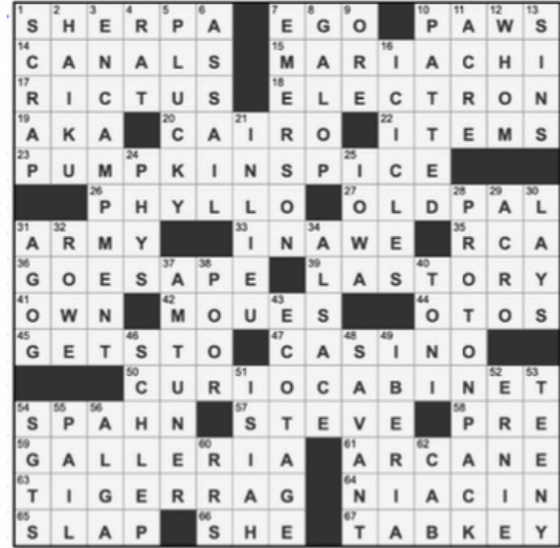
Puzzle #6 – Brad Wilber