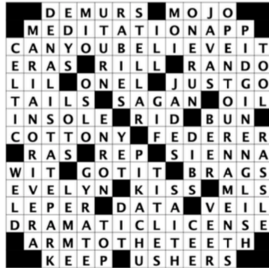
Puzzle #6 – Quiara Vasquez